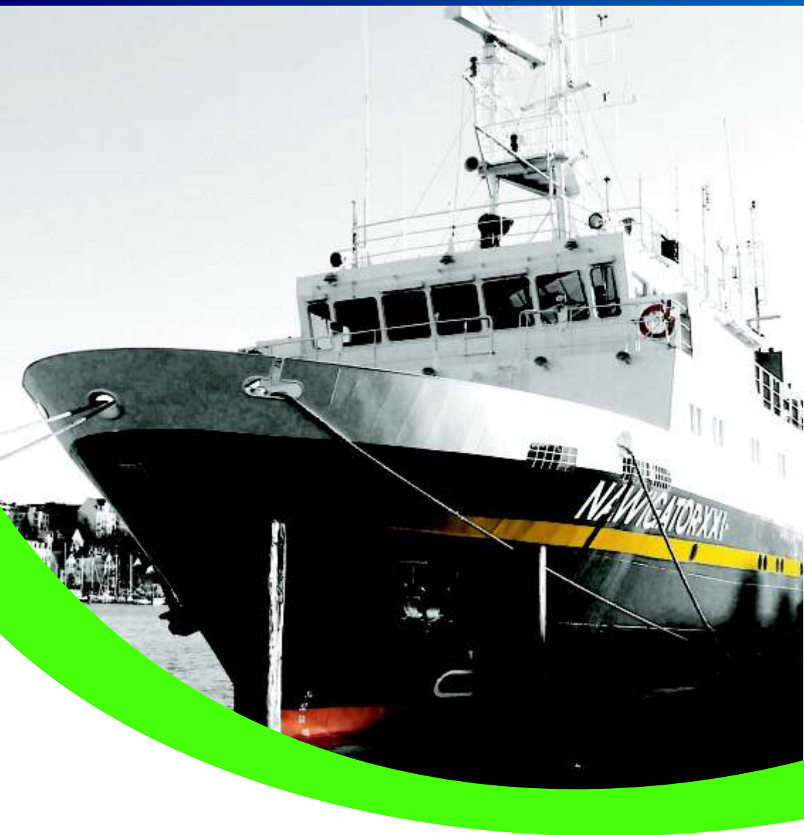
M/S NAVIGATOR XXI